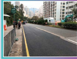
竹園道近竹園北邨 (東行線) Chuk Yuen Road near Chuk Yuen North Estate (East Lane)