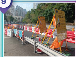
9 沙田坳道近黃大仙醫院 Shatin Pass Road near Wong Tai Sin Hospital