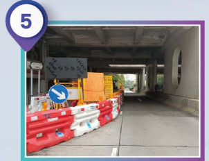
5 竹園道近竹園北邨(東行線) Chuk Yuen Road near Chuk Yuen North Estate (East Lane)