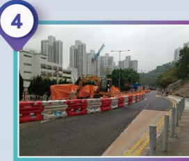
4 竹園道近鵬程苑 Chuk Yuen Road near Pang Ching Court