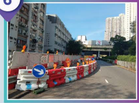
6 竹園道近竹園南邨(西行線) Chuk Yuen Road near Chuk Yuen South Estate (West Lane)