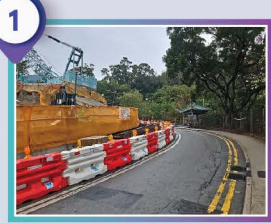
1 通往獅子山公園的道路 Access Road Leading To Lion Rock Park

Water mains are being laid along Chuk Yuen Road, Shatin Pass Road, Lung Fung Street, Sheung Fung Street and Tsz Wan Shan Road. The purpose of these works is to connect the relocated service reservoirs to the existing fresh and salt water supply network. Open trench excavation works are currently conducted at locations 5, 6, 8, 10, 11 and 12, while trenchless excavation works are being carried out at locations 2 to 4 and 9 to 10. We will monitor the traffic condition closely and adjust the temporary traffic arrangement when necessary.