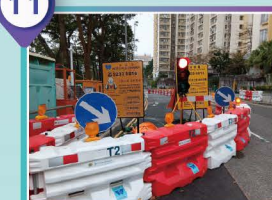
11 慈雲山道 Tsz Wan Shan Road