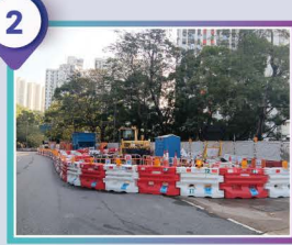
2 竹園道近天馬苑 Chuk Yuen Road near Tin Ma Court