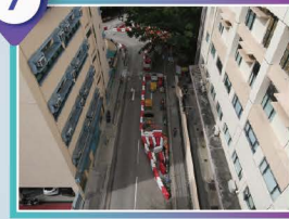
7 竹園道/沙田坳道交界 Junction of Chuk Yuen Road and Shatin Pass Road