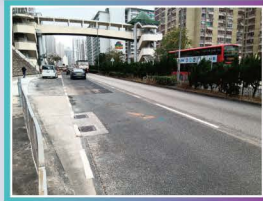
竹園道近鵬程苑 Chuk Yuen Road near Pang Ching Court