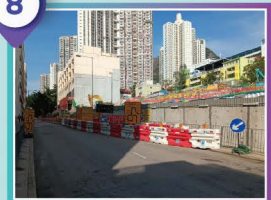
8 龍鳳街 Lung Fung Street