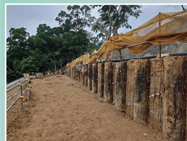
挖掘及側向支撐工程 Excavation and Lateral Support Works