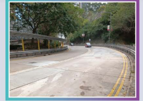
雙鳳街 Sheung Fung Street