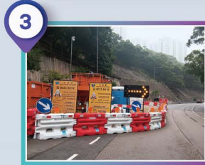
3 竹園道近天宏苑 Chuk Yuen Road near Tin Wang Court