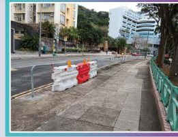
慈雲山道 Tsz Wan Shan Road