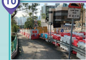
10 沙田坳道 Shatin Pass Road