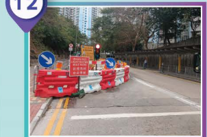
12 雙鳳街 Sheung Fung Street